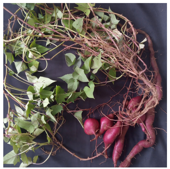
Figure 1: Tuberous root of sweet potato

The sweet potato plant is an herbaceous perennial vine, bearing alternate heart-shaped or palmately-lobed leaves and medium sized sympetalous flowers (Figure 1). The edible tuberous root is long and tempered with smooth skin. It is considered as the food security crop due to its low agriculture input requirements and high yields in wider climatic conditions (Ziska et al., 2009). This crop is recently changing from a sustainable low-input, low-output crop to a significant cash crop. It is valued for its short growing period of 90 to 120 days, high nutritional content and sweetness. It is a major conventional crop, growing traditionally in limited area for domestic consumption purpose. The sweet potato is praised as a "poor man's crop" as it characteristically grown and consumed by inadequate communities especially by womenheaded families (Ndolo et al., 2001). As a food security crop, it can be harvested at the point of demand as gradually (Tairo et al., 2005), also contributing to a reliable source of food and revenue to pastoral farmers who are frequently susceptible to regular crop damages. The sweet potato possesses medicinal qualities which contain anti-diabetic, anti-cancer and antiinflammatory properties which play chief role as an energy and phytochemical source in human nutrition. In regions of Japan, Kawagaa variety of sweet potato has been eaten raw to treat anemia, hypertension and diabetes.