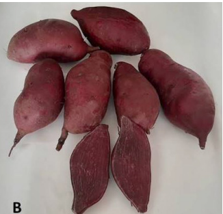
Figure 2: The beta-carotene rich orange fleshed sweet potato (A), Anthocyanins rich purple fleshed sweet potato (B)